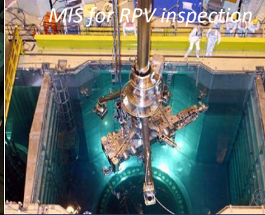
MIS for RPV inspection